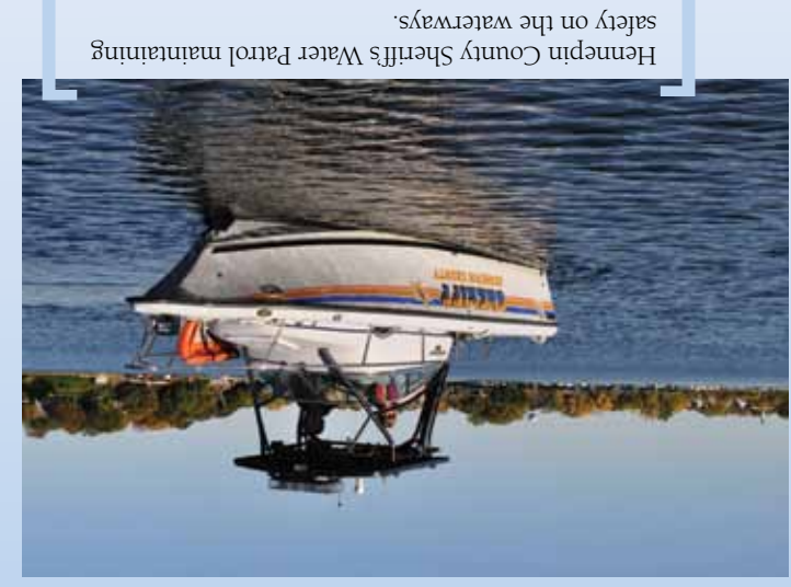
Hennepin County Sheriff's Water Patrol maintains safety on the waterways.

Minnetonka Yacht Club catboat ca. 1891. As you enjoy the lake, remembering Lake Minnetonka's history can inform, inspire and offer a new perspective. To learn more about Lake Minnetonka - or "Big Water" - visit www.lmhs.org or other available historical resources.